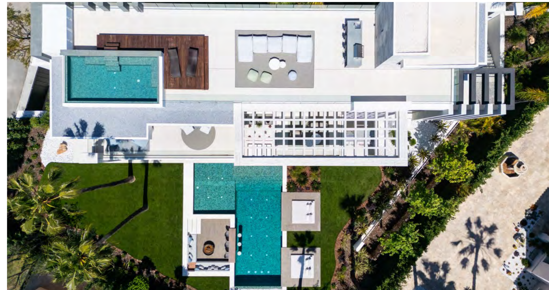
Nestled in Nueva Andalucia, Rio Verde 47 enjoys a prime location close to amenities, international schools, Puerto Banus and the Golden Mile. Experience the epitome of luxury living in this stunning villa.