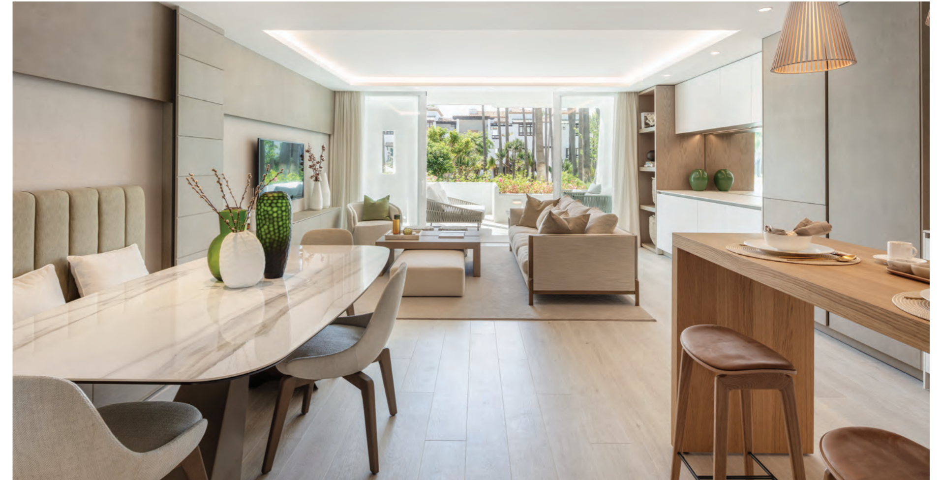
The living space is open-plan, seamlessly integrating the living, dining and kitchen areas for a sense of flow and spaciousness.